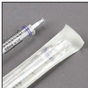
1820 - Sterile, individually wrapped