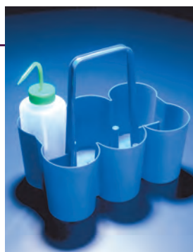
Polypropylene bottle carrier