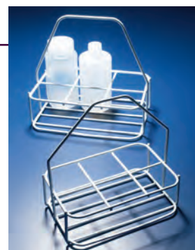
Polyamide coated steel bottle carriers