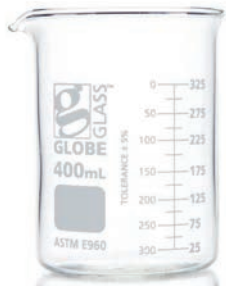
Griffin Style Beakers

The new gold standard for laboratory glassware.