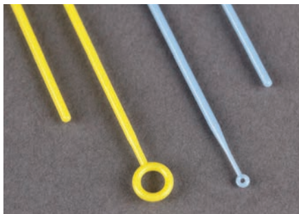
Loops feature integrated needle at reverse end