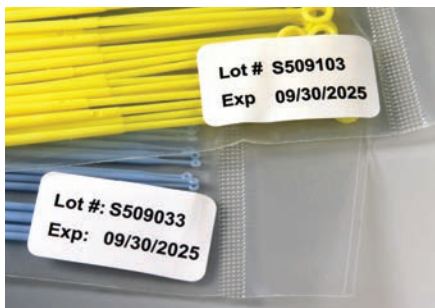
Each bag is individually labeled with lot number and expiration date