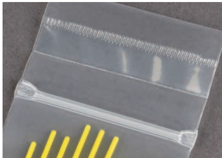
Packaged in resealable, tamper-evident bags