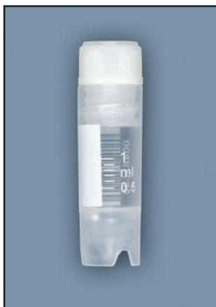
Item# 3001 (shown actual size)