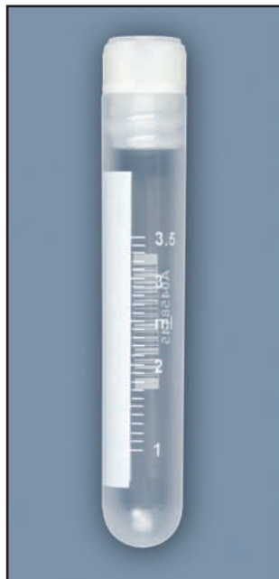
Item# 3004 (shown actual size)